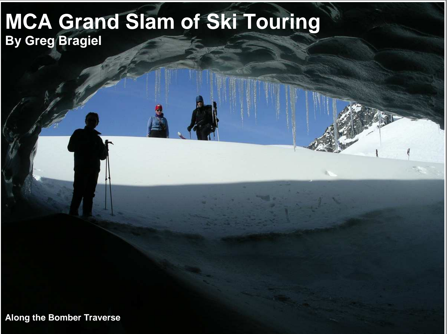
Along the Bomber Traverse

The idea of doing all the classic ski tours in the Anchorage area in one season was first conceived in the fall of 2006. These trips had been done by many of us over the last few seasons, so why not do all of them in one season, all in a row? Why not call it the Grand Slam of Ski Touring?