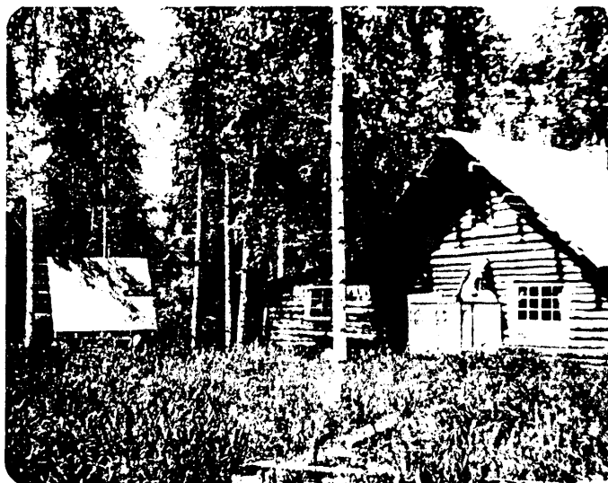
2nd Frame Home 1974-75