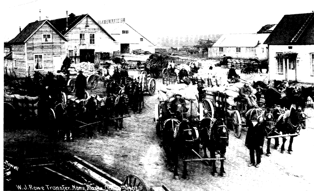
◀ W. J. Rowe Transfer, Nome, Alaska 1907.