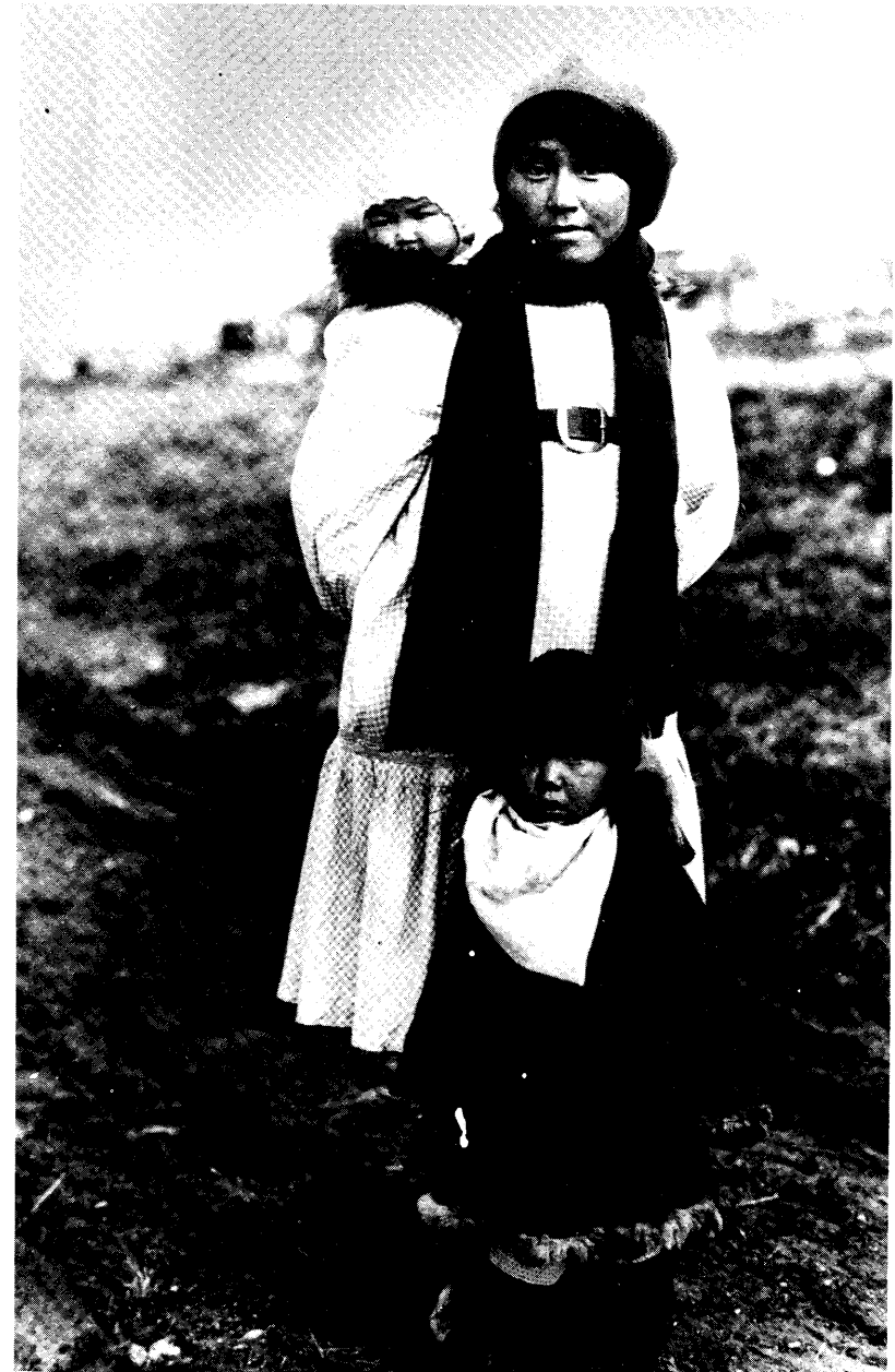
Eskimo and children at Nome, 1927. ▼