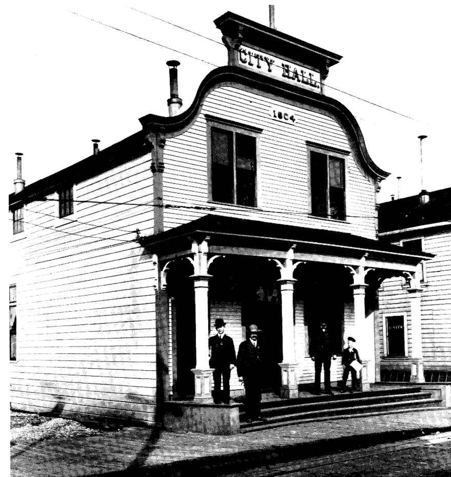
City Hall, Nome, Alaska 1905. ▲