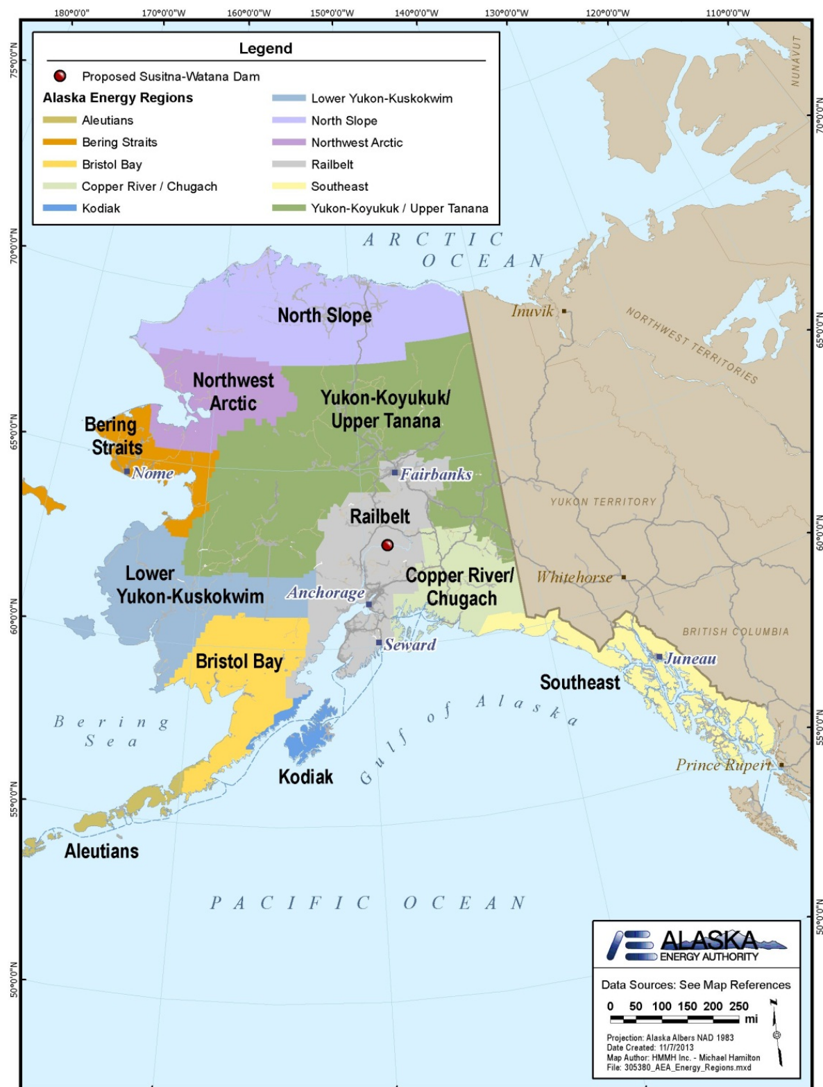
Figure 5.3-5. Alaska Energy Regions