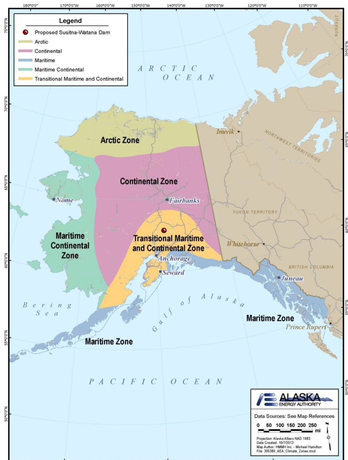
Figure 5.1-1. Alaska Climate Zones