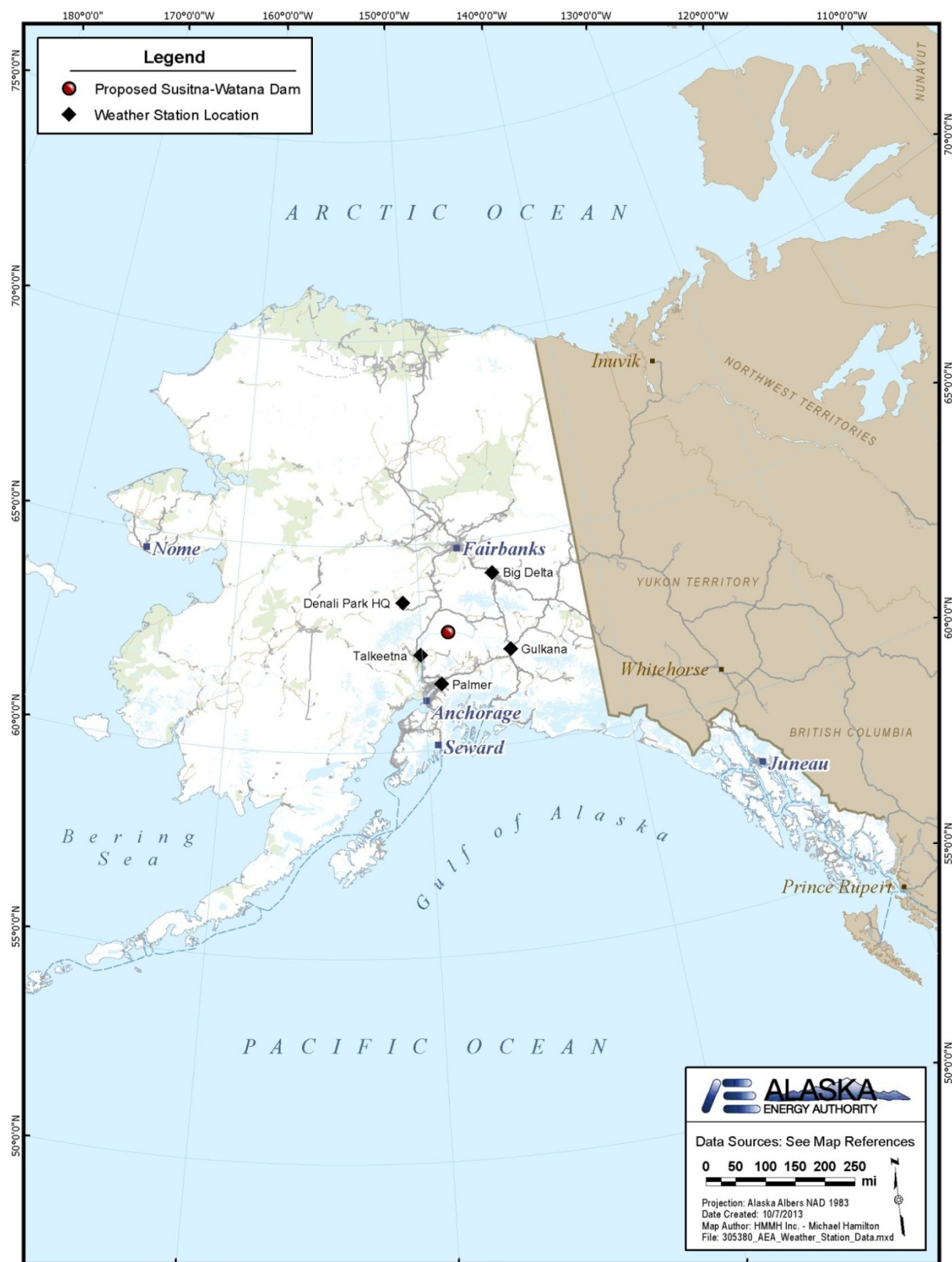
Figure 5.1-2. Weather Station Data Locations Representative of the Project Site