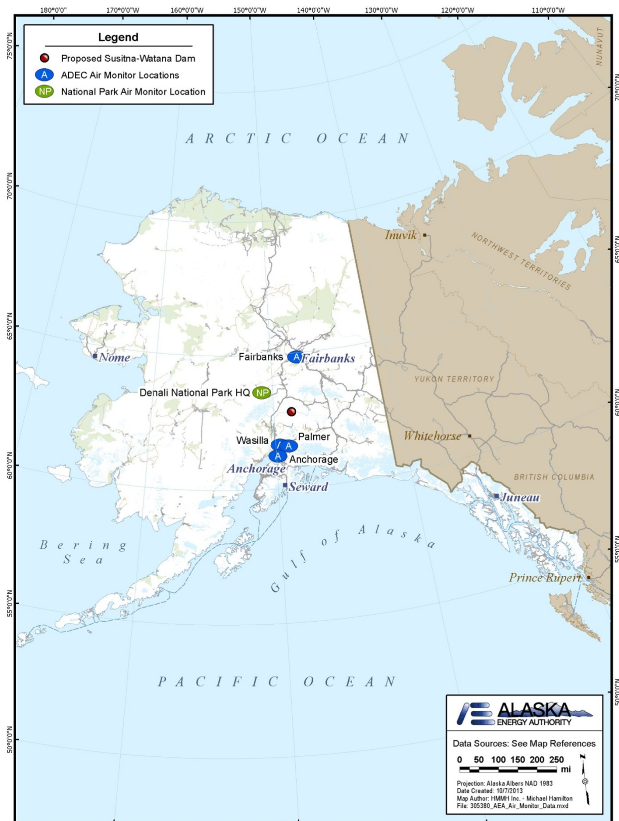
Figure 5.1-4. ADEC and National Park Service Air Monitoring Locations