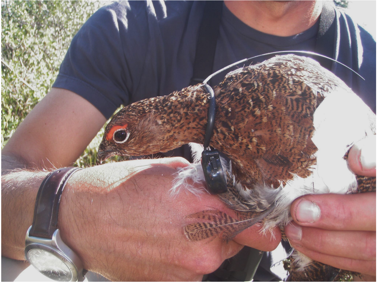
Figure 4.1-2. Male Willow Ptarmigan equipped with an ATS 3950 Radio Transmitter.