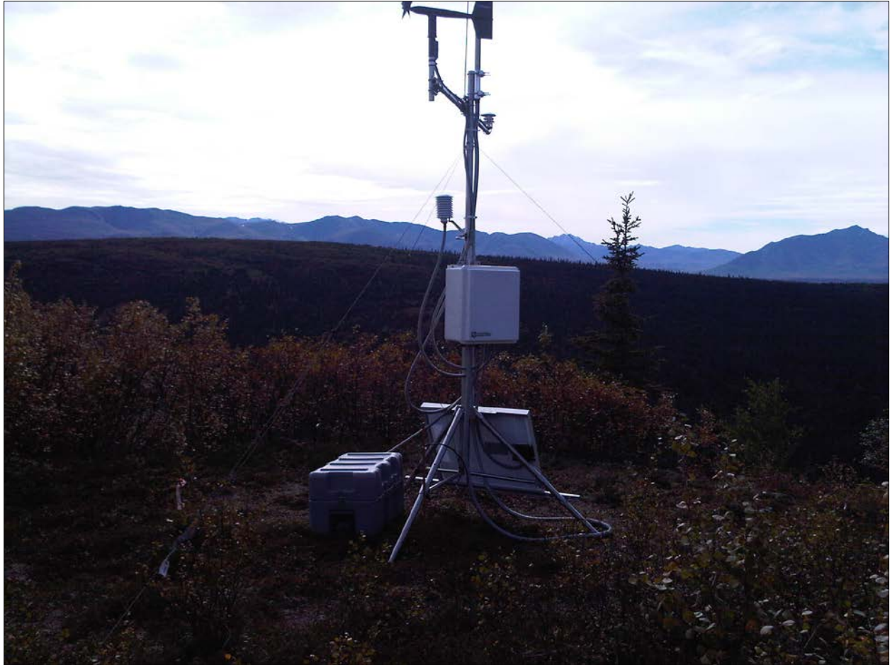
Figure 5.5-2. Example of a 10-foot (3-meter) tripod MET station installed above the proposed Watana Dam site.