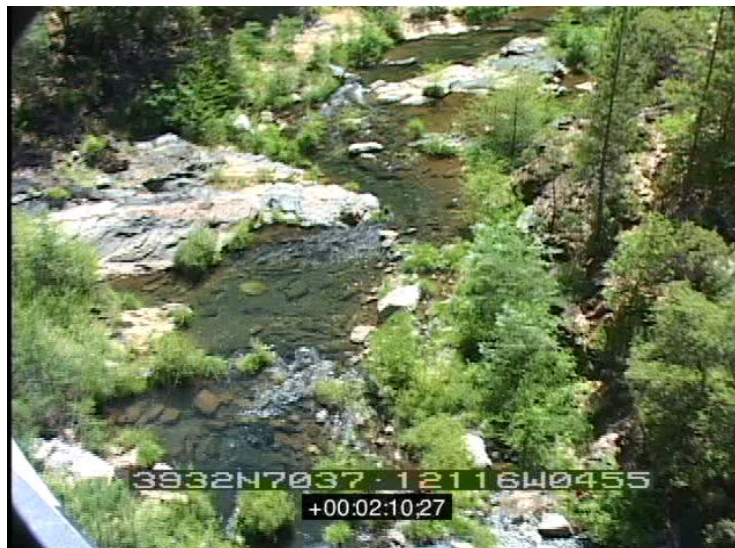
Figure 3. Example of expected image quality from an aerial video still also displaying onscreen GPS and time stamp.

The video will be shot during a period of optimal water clarity during lower flow conditions in September 2012. The video will be shot from the right rear of the helicopter, with its cabin door off to allow for maximum direct viewing. A narrator/navigator will be positioned in the left front next to the pilot. The video elevation will be shot from 75 to 125 feet to allow for safe navigation, but sufficient resolution. The collected video will be post-processed into a navigable DVD that can be played on either an office computer or a home DVD player. The DVD will include a GPS stamp so that the viewer can reference the location on topography maps or with other existing aerial imagery databases. Video stills will be collected to also expand the available aerial imagery and support habitat mapping reporting.