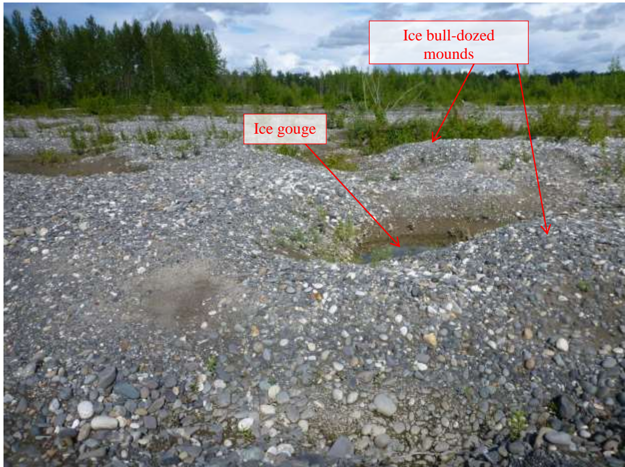
Figure 8. Recent ice gouging and ice bull-dozing on a mid-river gravel bar, Riparian Vegetation Study area, Susitna River, Alaska, 2012.