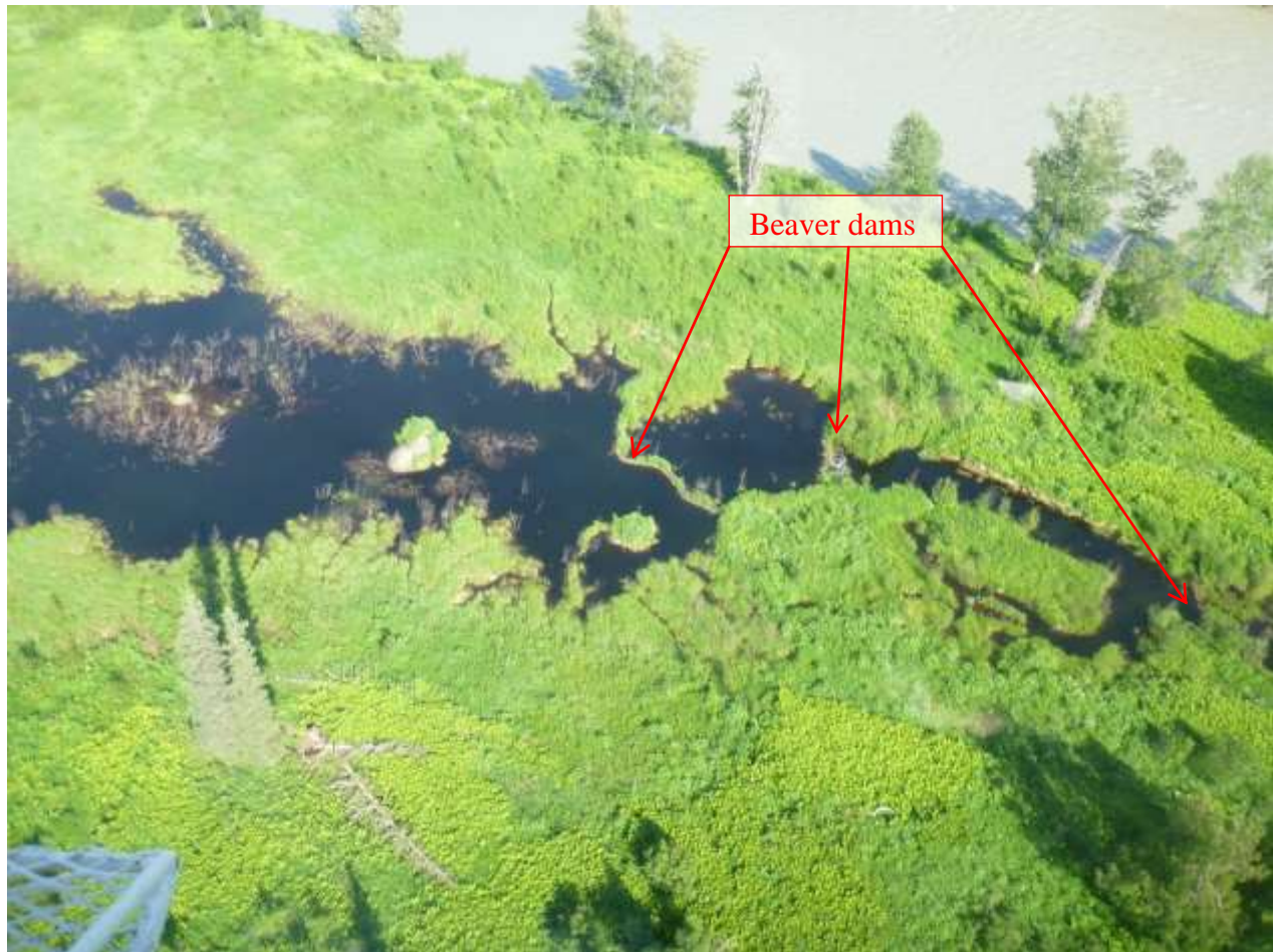
Figure 9. Aerial view of beaver pond complex, Riparian Vegetation Study area, Susitna River floodplain, Alaska, 2012.