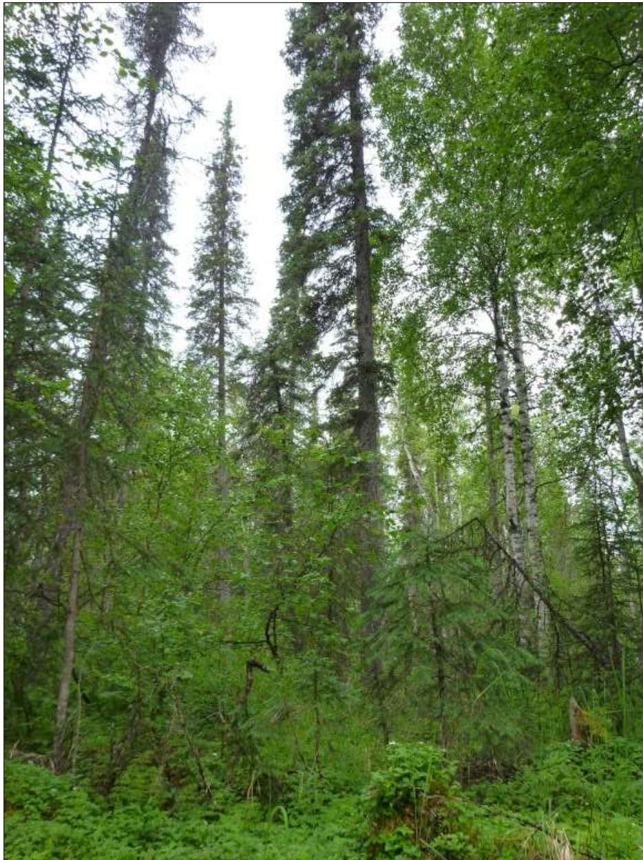
Figure 3. Open Spruce–Paper Birch forest, Riparian Vegetation Study area, Susitna River floodplain, Alaska, 2012.