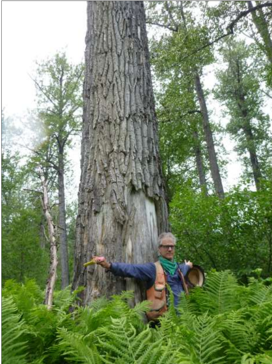
Figure 7. Ice scar on balsam poplar, Riparian Vegetation Study area, Susitna River floodplain, Alaska. Scientist in photo is ~1.9 meter (6.2 feet) tall.