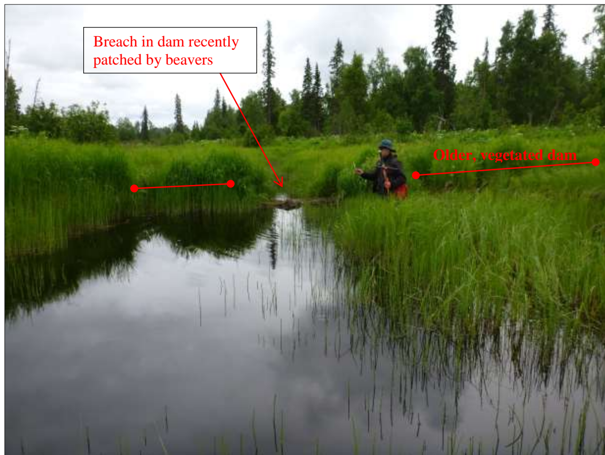
Figure 10. Beaver impoundment showing older, vegetated dam with breach recently maintained by beavers, Riparian Vegetation Study area, Susitna River floodplain, Alaska, 2012.