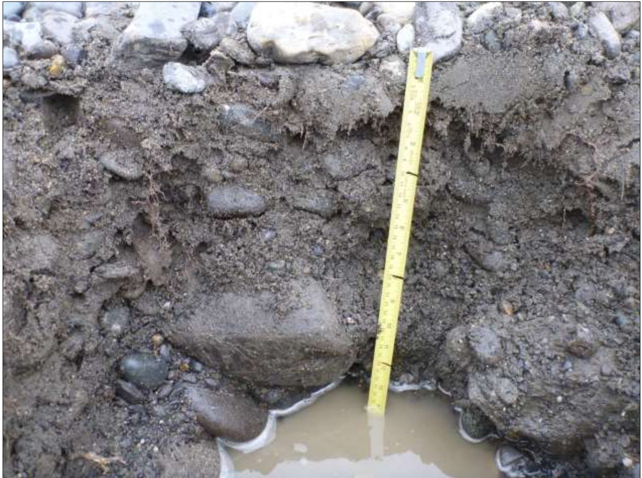
Figure 6. Oxyaquic Cryorthents on an active cobble bar showing water table at 35 centimeter (14 inches) below soil surface, Riparian Vegetation Study area, Susitna River floodplain, Alaska, 2012.