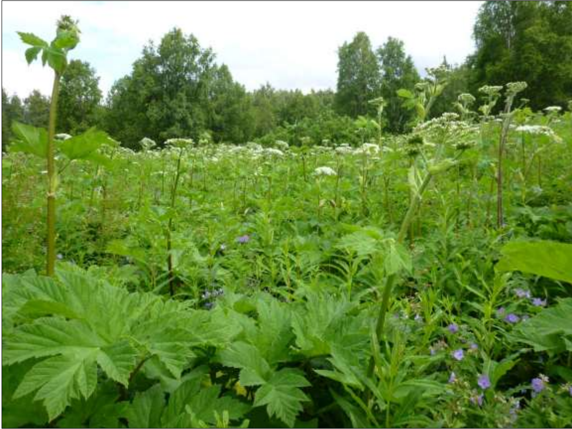
Figure 4. Large Umbel Meadow, Riparian Vegetation Study area, Susitna River floodplain, Alaska, 2012. Vegetation in photo is approximately 1.5–2.0 meters (4.9–6.6 feet) tall.