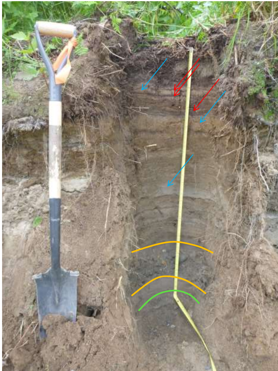
Figure 5. Typical Cryofluvents at a river bank exposure, Riparian Vegetation Study area, Susitna River floodplain, Alaska, 2012.

Dark horizontal lines (red arrows) indicate layers of organic material buried by periodic past sedimentation events. Orange and grayish layers (blue arrows) are riverine sands and silts. Cobbly/gravelly layer (between orange lines) indicates historic large, powerful flood event. The cobbly layer at the bottom of the pit represents the original cobble bar surface (below green line). Shovel in photo is approximately 1 meter (3.3 feet) tall.