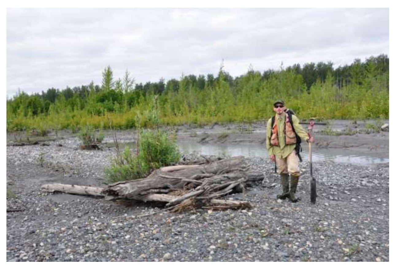
Photograph 32. July 2, 2012 Lower Susitna River below Talkeetna. Typical loose, unstable wood debris.