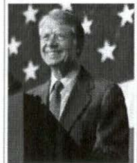
Jimmy Carter 1978: Book II

COLLECTION: Public Papers of the Presidents