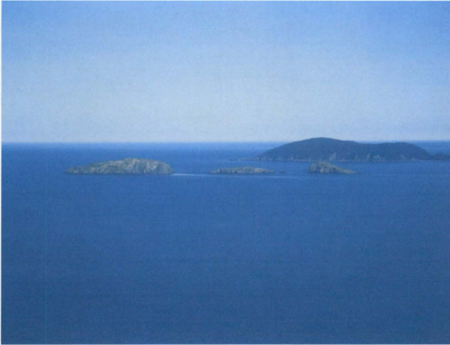
Photo: Triplet Islands