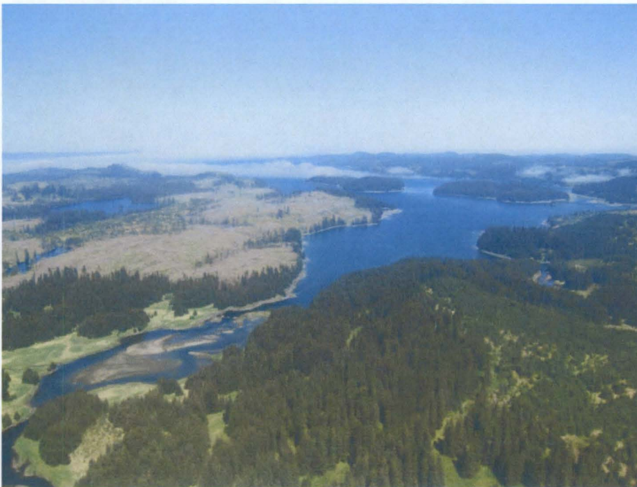
Photo: Discoverer Bay, Northern Afognak Island