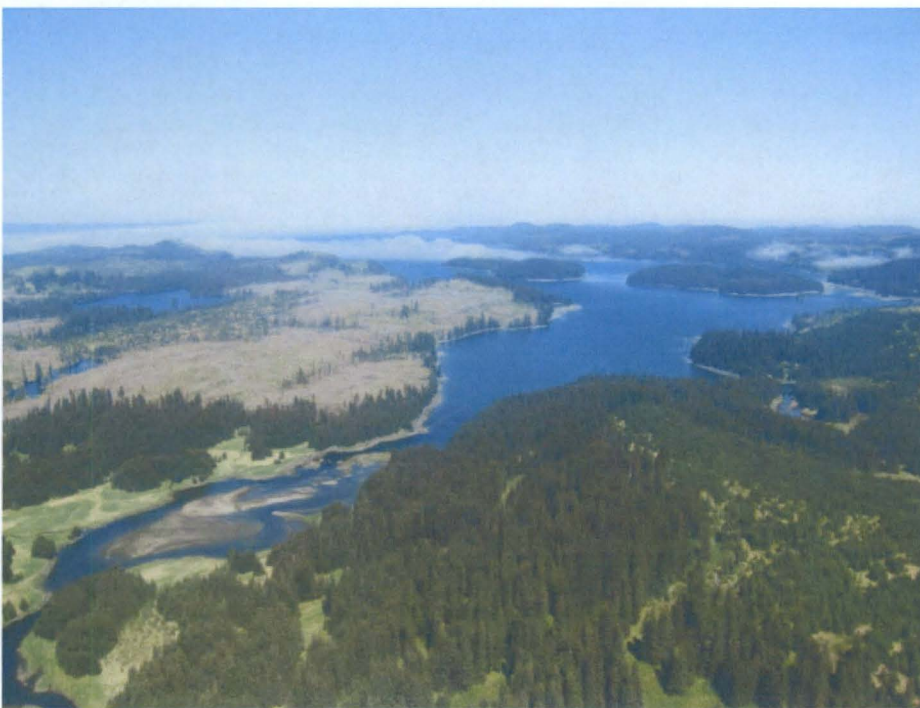
Photo: Discoverer Bay, Northern Afognak Island