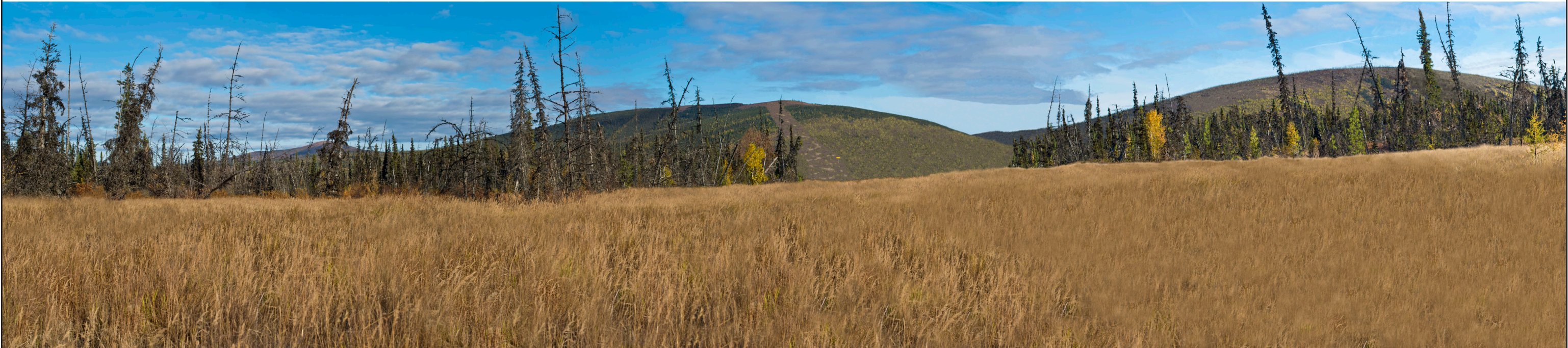
Simulation This image has been scaled to fit on 11x17 paper, and therefore should be used for illustrative purposed only. To view this simulation at an accurate scale, images should be printed on a 36x56 size paper, and viewed at approximately 2 feet