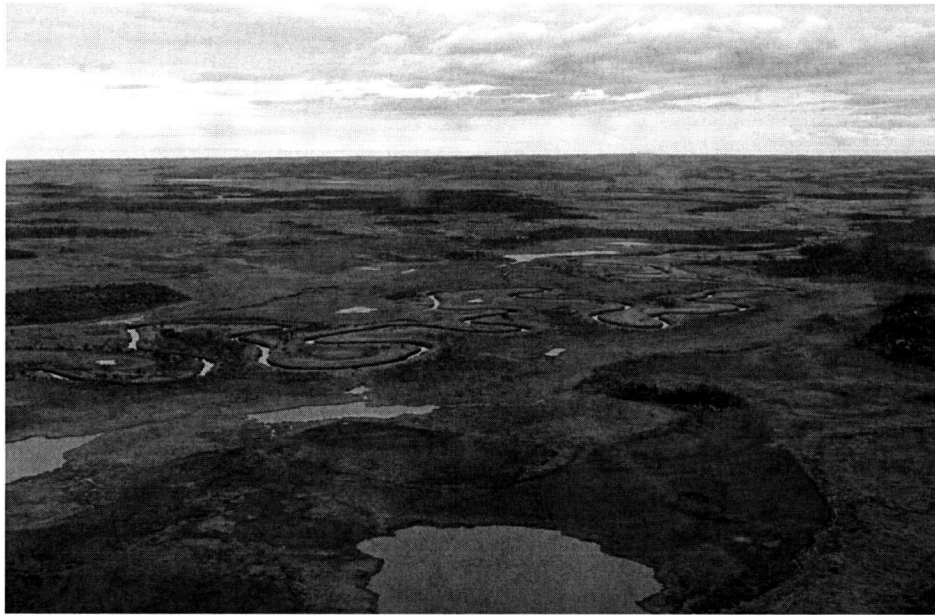
Photo 1.3. Bear Creek, Kvichak planning Block.