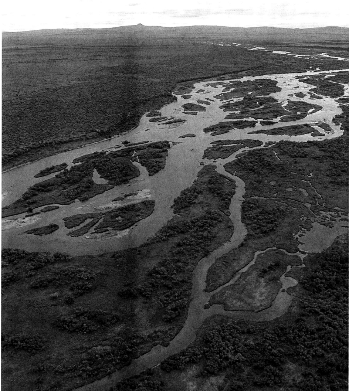
Photo 1.1. Alagnak River, View South.