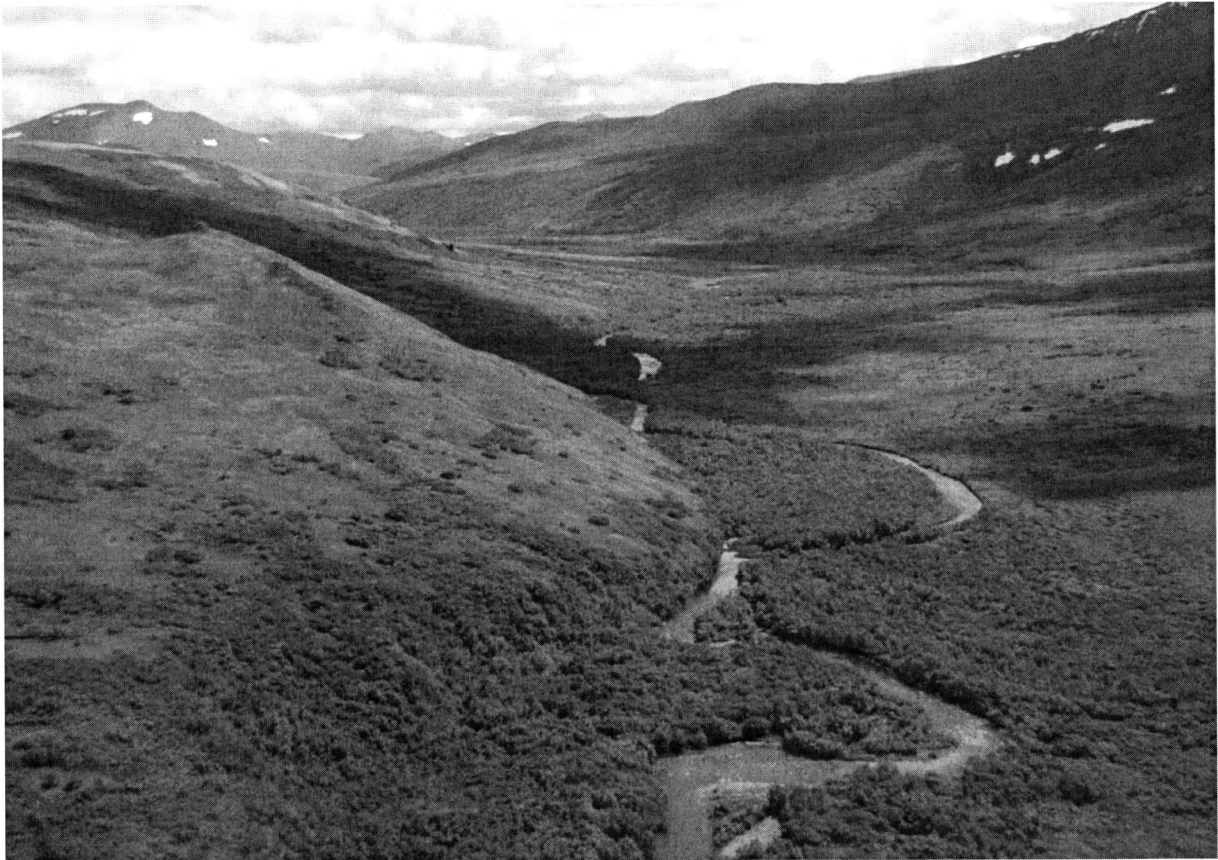
Photo 1.2. Jacksmith Creek, Goodnews planning block

In addition to BLM-managed lands, the planning area includes lands administered by the State of Alaska (State), Native corporations, the National Park Service (NPS), U.S. Fish and Wildlife Service (FWS) and private landowners (Map 1.1; Table 1.1).