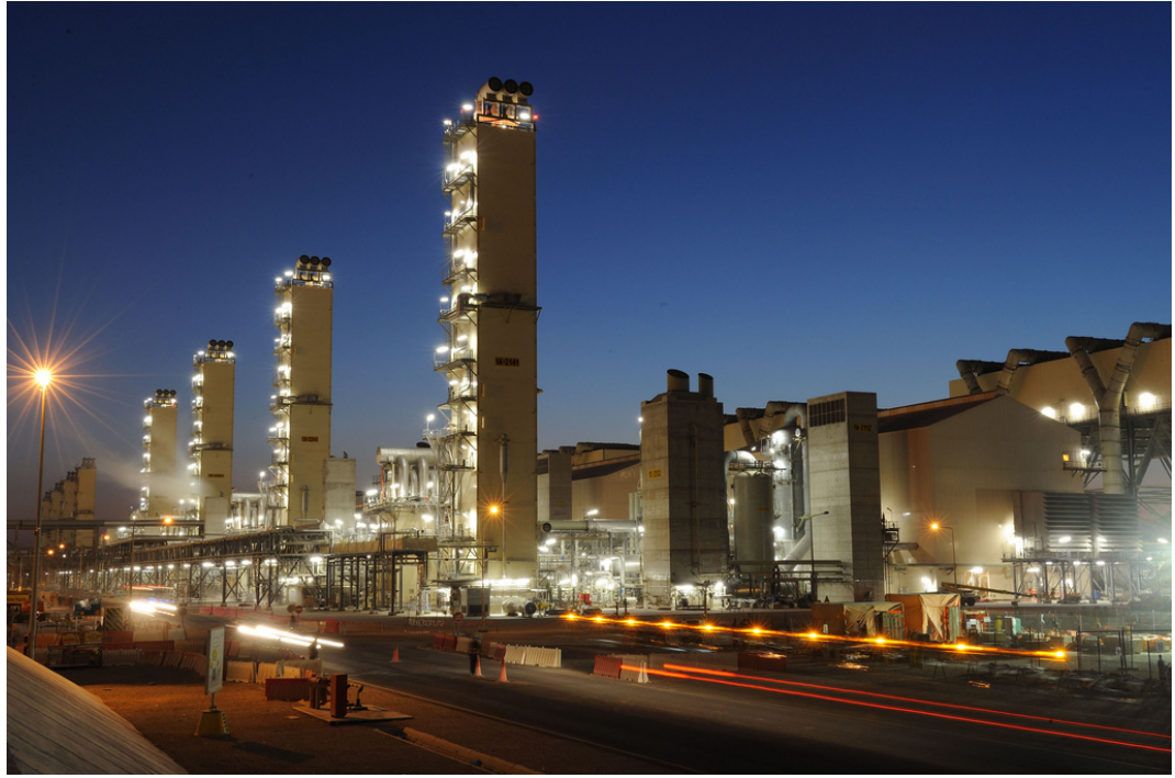
Air separation towers at Shell's Pearl GTL plant in Qatar.

Qatar is a special case. Two GTL plants started-up there in the past five years. Qatar holds <u>modest oil reserves</u> for a Persian Gulf nation but is spectacularly endowed with natural gas. The North Field, the world's largest natural gas field, lies offshore Qatar. It holds about 900 trillion cubic feet of natural gas, nearly 40 times the size of Prudhoe Bay, Alaska's natural gas crown jewel.