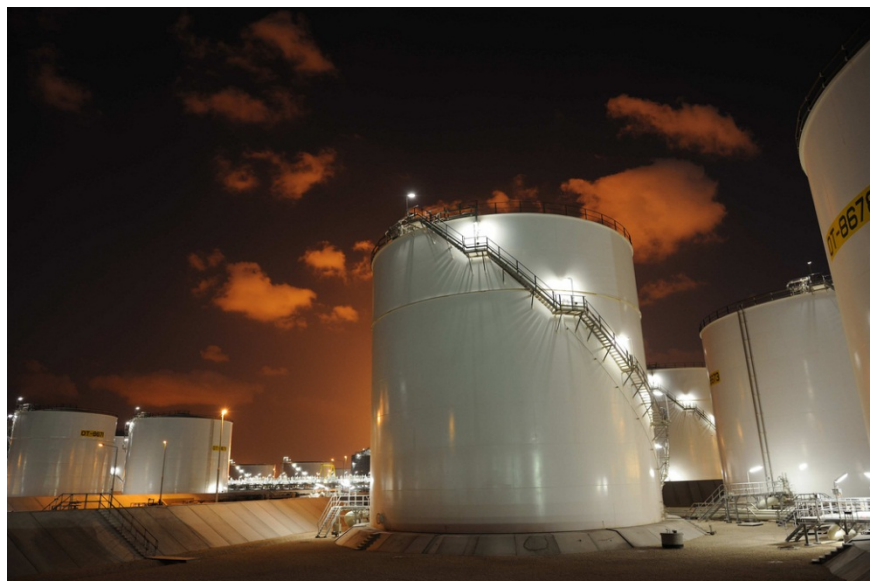
Source: Shell Storage tanks for liquids made at Shell's Pearl GTL plant in Qatar.

But could low prices also jump-start a niche industry — called gas to liquids, or GTL — that for nearly a century has struggled to establish a foothold in the world of fossil fuels?