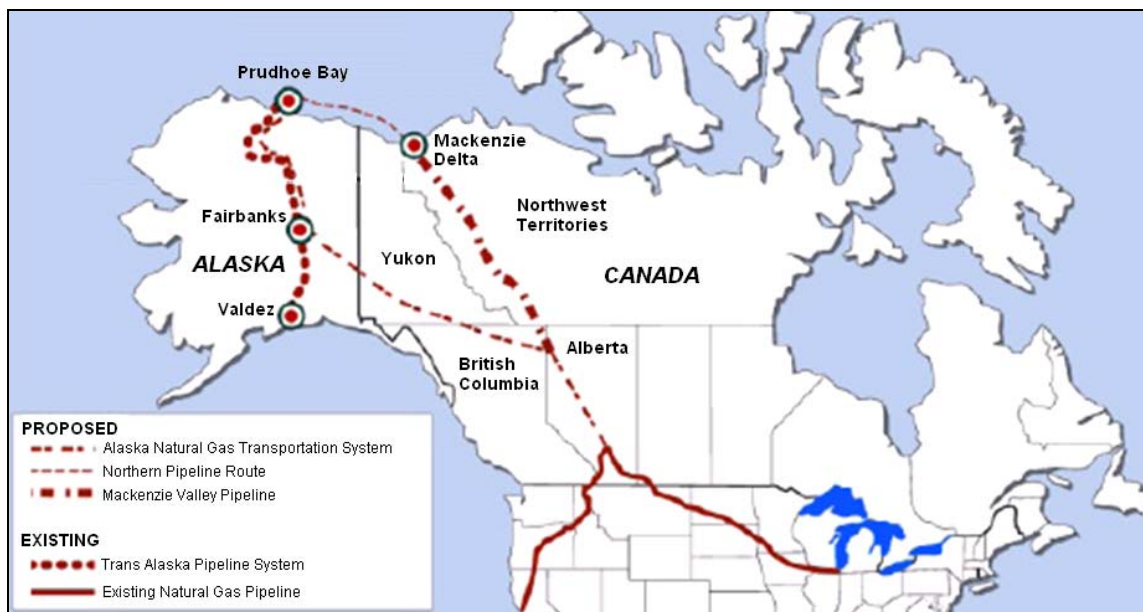
Figure 1. Alaska Oil and Natural Gas Pipelines 2011