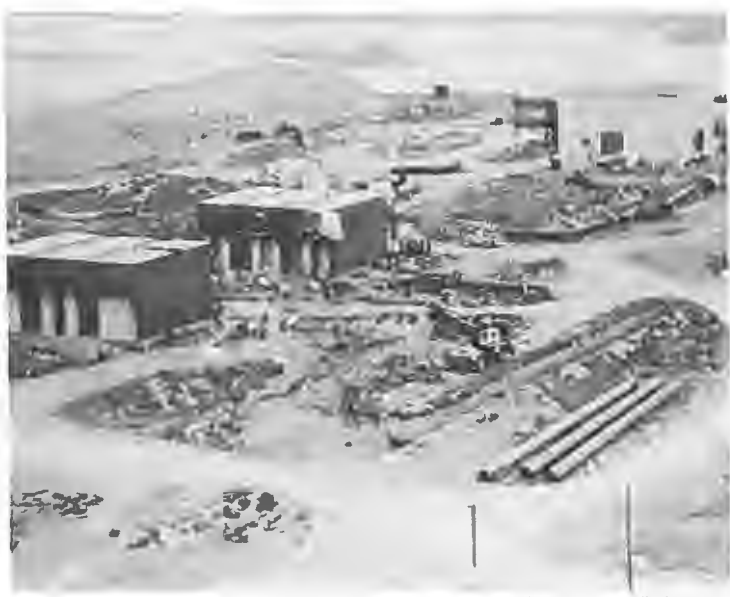
Aerial view of construction of compressor station facilities at Monchy, Saskatchewan