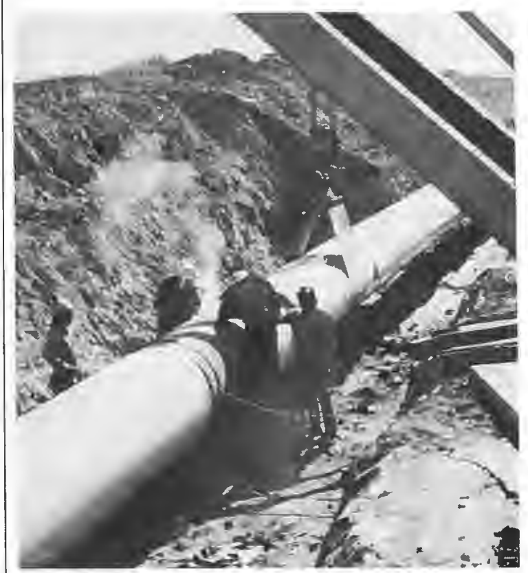
The final tie-in weld, completed on August 17 south of Beiseker, Alberta, wraps up construction on the Eastern Leg of the Alaska Highway gas pipeline in Canada.