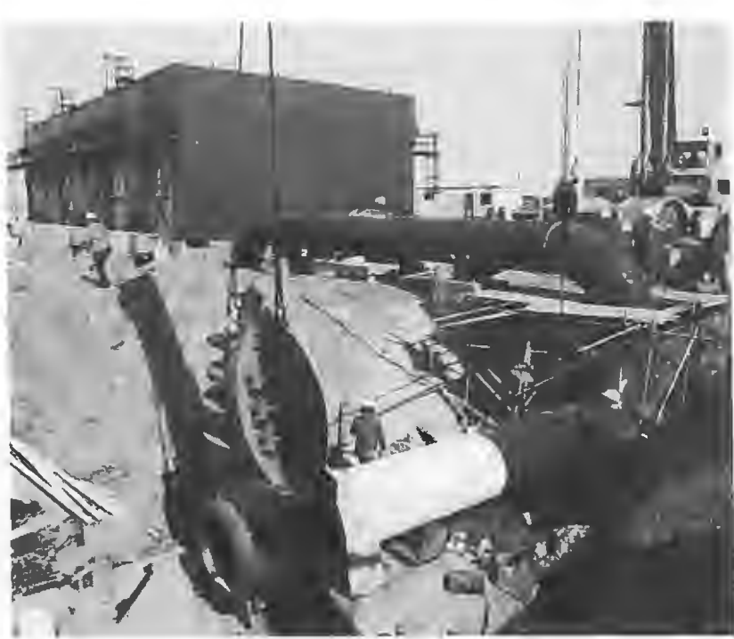
An orifice plate is lowered into the yard piping system to measure gas volumes and pressures at the compressor station under construction at Piapot, Saskatchewan.