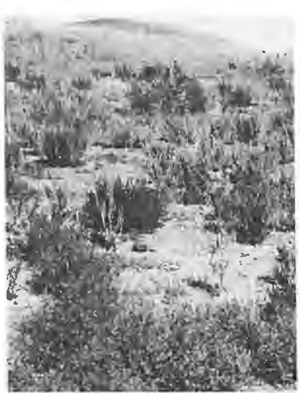
A year following pipeline construction, weeds natural to the area grow along restored Eastern Leg right-of-way in Saskatchewan's Frenchman River valley. Environmental staff of the Northern Pipeline Agency continue to monitor the results of the land reclamation and revegetation work undertaken by the Foothills segment companies in areas disturbed by construction activity.