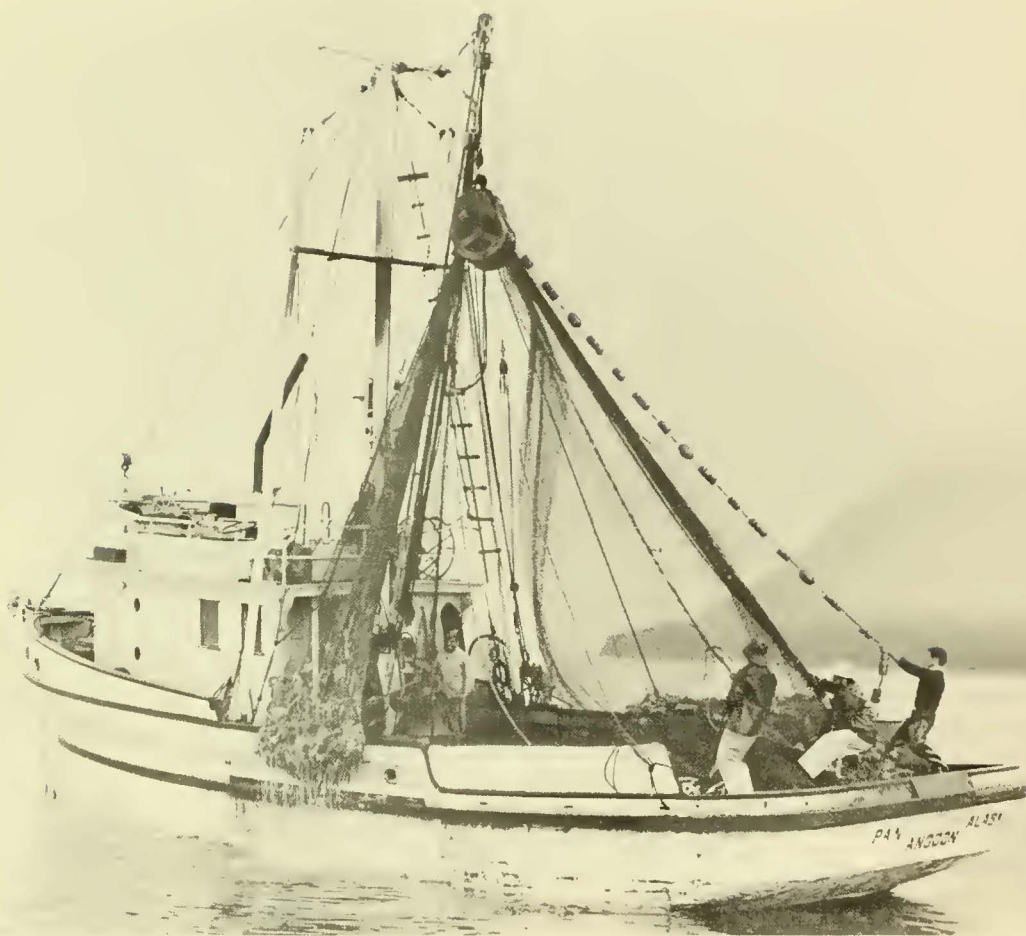
Figure 5.—Hauling in the net on a pink salmon purse seiner. When set for fishing, the net encloses an area of about 2 acres.