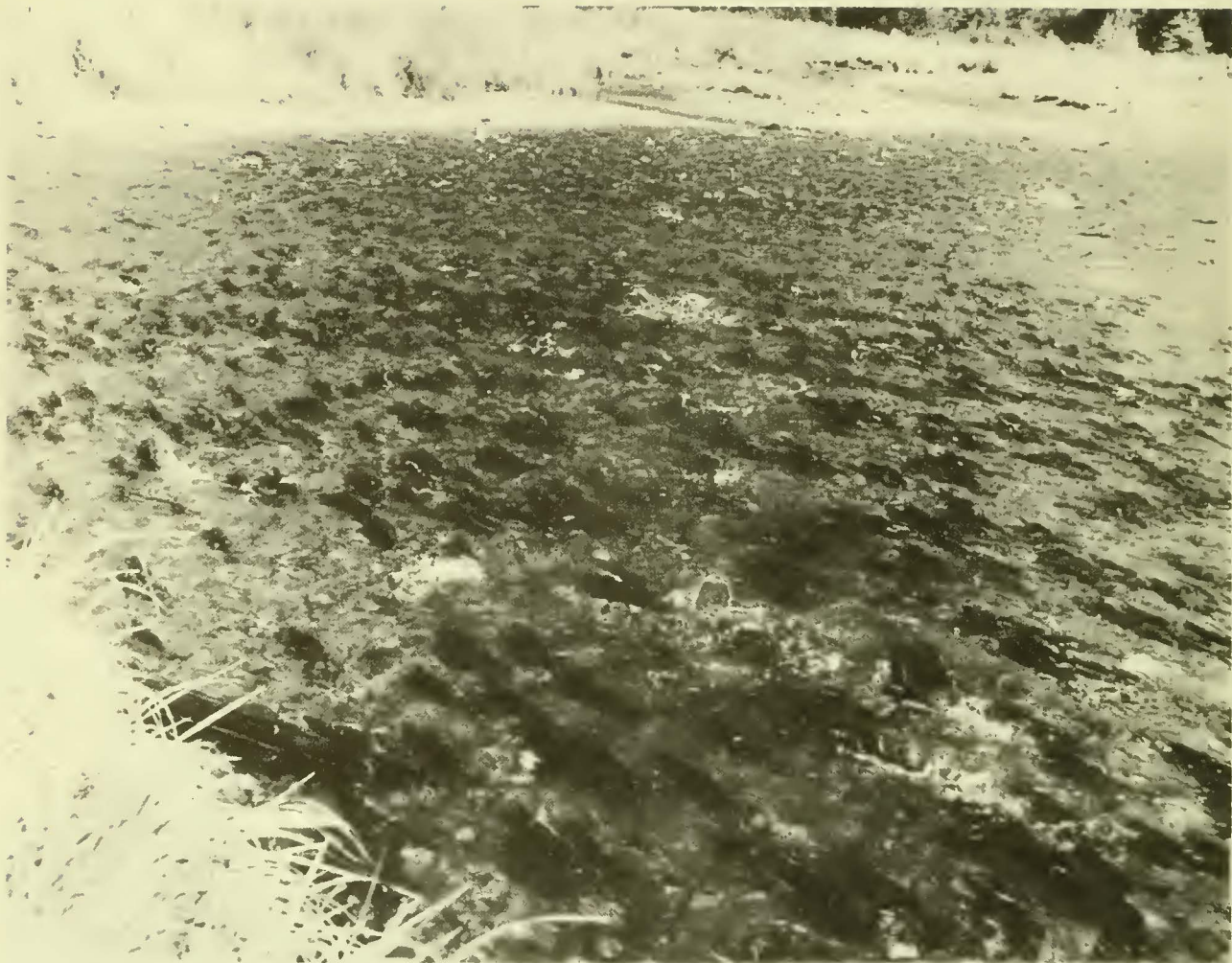
Figure 4.—Pink salmon spawning in the intertidal zone of a creek.

In addition to the commercial uses for pink salmon, Indians and Eskimos along the Arctic coasts take thousands of them in traps and gill nets for personal use.