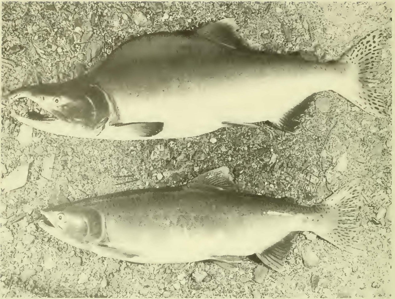
Figure 1. - Mature pink salmon—male (upper), female (lower).

in southern British Columbia and Puget Sound, runs large enough for profitable commercial fishing occur only in odd years. Conversely, in western Alaska since 1954, the even-year runs have been the larger. Fortunately the major pink salmon-producing areas of Alaska do not suffer from this type of off-year scarcity.