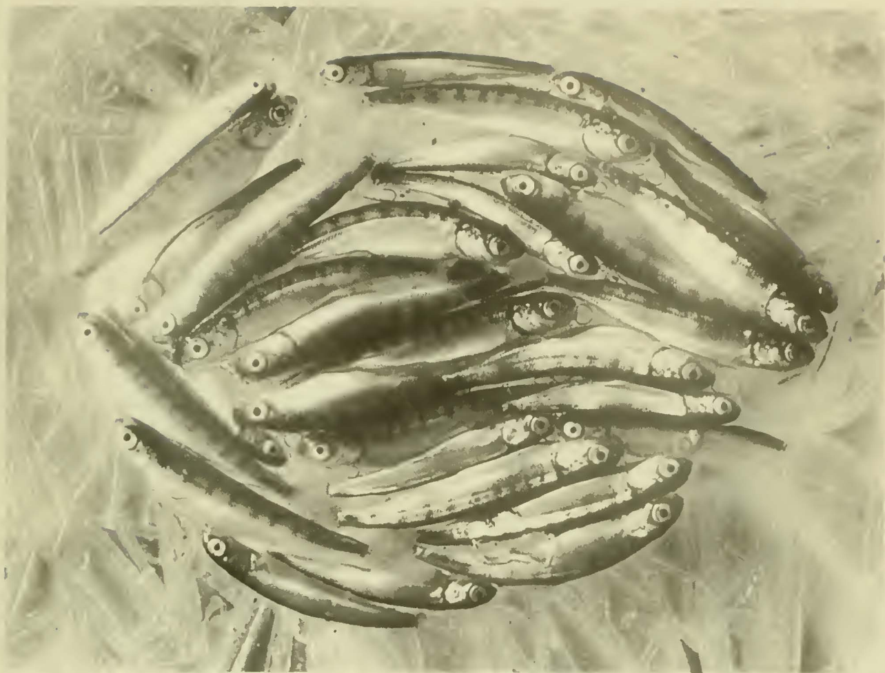
Figure 2.—Pink and chum salmon fry that have just emerged from the streambed. The pink salmon are distinguished by their smaller size and the lack of the parr marks that are noticeable on the backs of the chum salmon fry. In these live fish the fins are nearly transparent because they are very thin and unpigmented.

and a new egg pocket is formed to receive the next cluster. Sand and gravel protect the eggs from sunlight, floods and predators, and the female protects them from being dug up by other females who are digging their own redds.