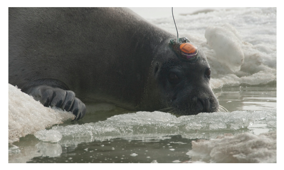
Figure 3. An adult male bearded seal, instrumented with an SDR, just before entering the water.

As of November 2009, SDRs from all three seals continue to function properly and transmit information daily via satellite link. As the ice cover returns in autumn and winter, we expect to see all three seals move south into the Bering Sea along with the advancing ice edge, yet remain in the shallow waters of the continental shelf. Owing to the success of this pilot program, we plan to work with other Alaska Native communities in the Chukchi and Bering Seas to identify opportunities to expand the study in 2010 and 2011.