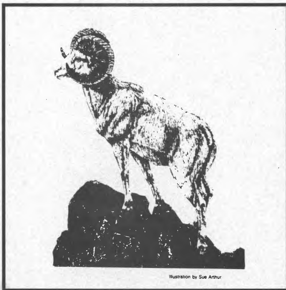
Illustration by Sue Arthur