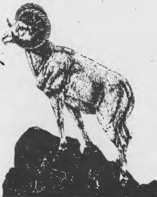
Illustration by Sue Arthur