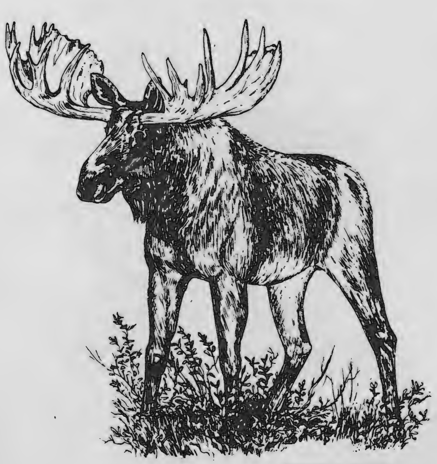
Illustration by Sue Arthur