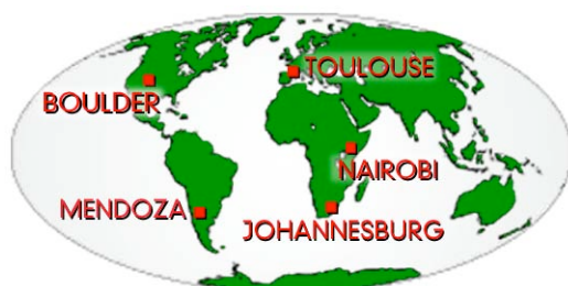
Fig. B.2. Map showing the locations of the World Data Center for Paleoclimatology, Boulder and its data mirrors around the world.

While the major centers provide ready access to data and information, they can only work as well as the users' connection via the Internet. This is one of the reasons that WDC-Paleoclimatology has worked with partners in various countries to establish mirror sites (Figure B.2). These distributed archives hold complete copies of the web and ftp holdings of the WDC-Paleoclimatology, providing regional access points to the data. This means that data can be made more accessible, benefiting scientists in the region of the data's origin. Bringing the data close to home encourages scientists to contribute their data – increasing participation in PAGES-organized regional to global efforts to understand our climate system. Currently four mirror sites are operating, with more under consideration.