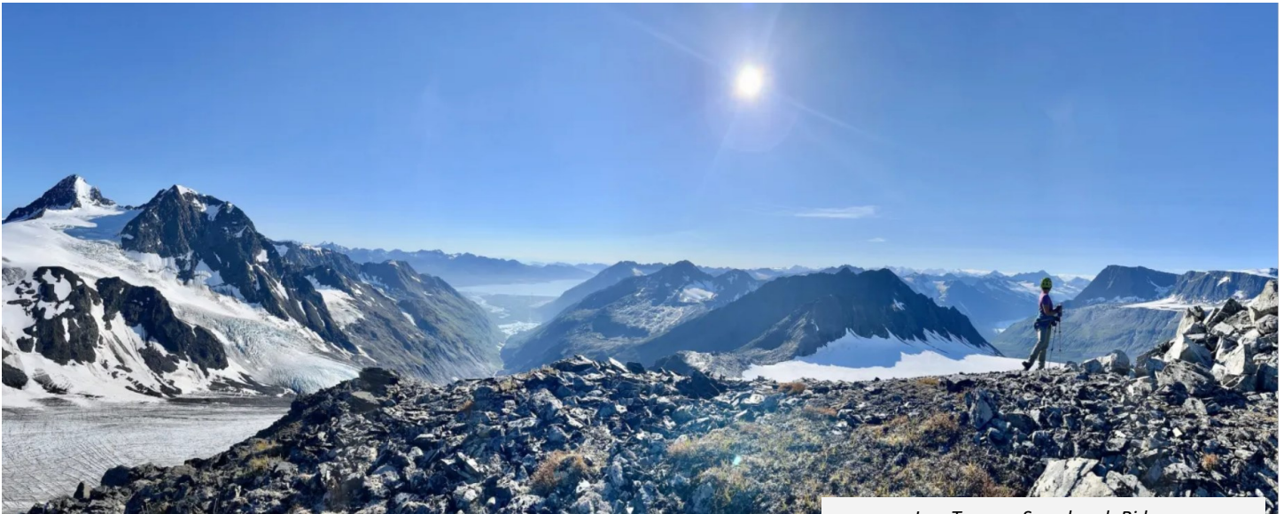
Jess Tran on Sourdough Ridge.

Prospectors Peak (5516') is one of the few named (on USGS map) summits in the Valdez, Alaska area Central Chugach. The more striking peak to its left (west), when viewed from the road system in the Valdez area, is unnamed as far as I know. As are the two higher and more prominent peaks to its right (east). These four 500'+ prominence peaks comprise what I refer to as the "Prospectors Massif." The highest and most prominent peak of the massif is the one just right (east) of Prospectors when viewed from the road system: Peak 5706' (Sourdough Peak). The second highest is 5600'+ Cheechako Peak, which is east of Sourdough. It's debatable which peak is the third highest: Prospectors or its neighbor to the west: 5500'+ Siltstone Peak. The names of these peaks, other than Prospectors, are my own. Thus named in keeping with the mining theme.