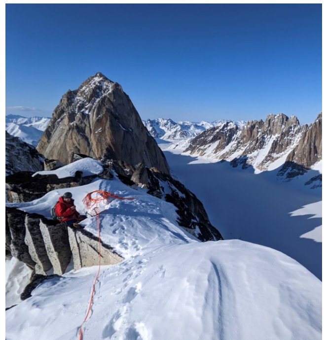
Top Left: The new route, taken from Sunrise Spire

I have read extensively through reports from the Kichatnas in the AAJ and was unable to find a record of this climb. Given its moderate grade and obvious nature from basecamp, it may have been climbed and unreported of course.