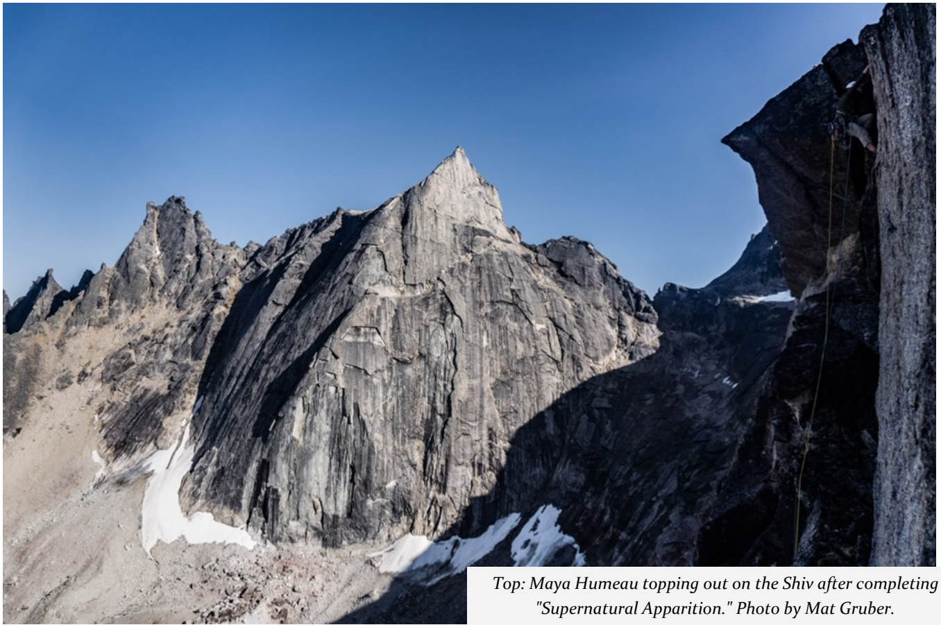
Top: Maya Humeau topping out on the Shiv after completing "Supernatural Apparition."