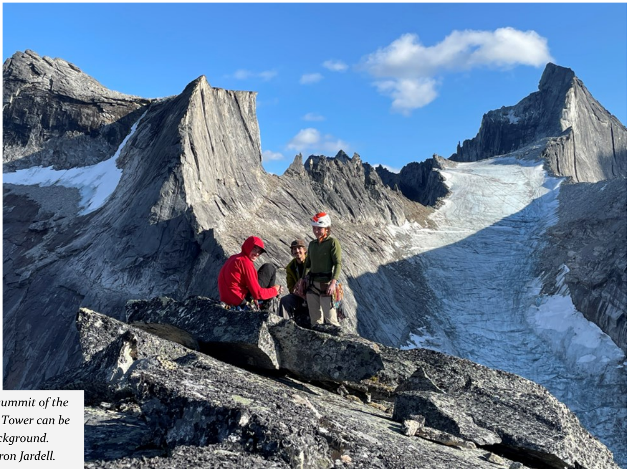
Our team on the summit of the Shiv, Whichmann Tower can be seen in the background.

All pitches were freed by at least one party-member. Examples of aid: leader fell, then swung on rope to gain adjacent crack, follower traversed free; cam was pulled on at tight belay to get around belayer; follower took to remove stuck piece, cam was pulled on to look over roof but not used to move over roof; follower was lowered to free stuck haul bag. No bolts or pitons were placed. Several nuts were left for rappels as was some webbing. Rappels were only done when downclimbing could not be done safely. Climbs were done in single push style with no fixed ropes.