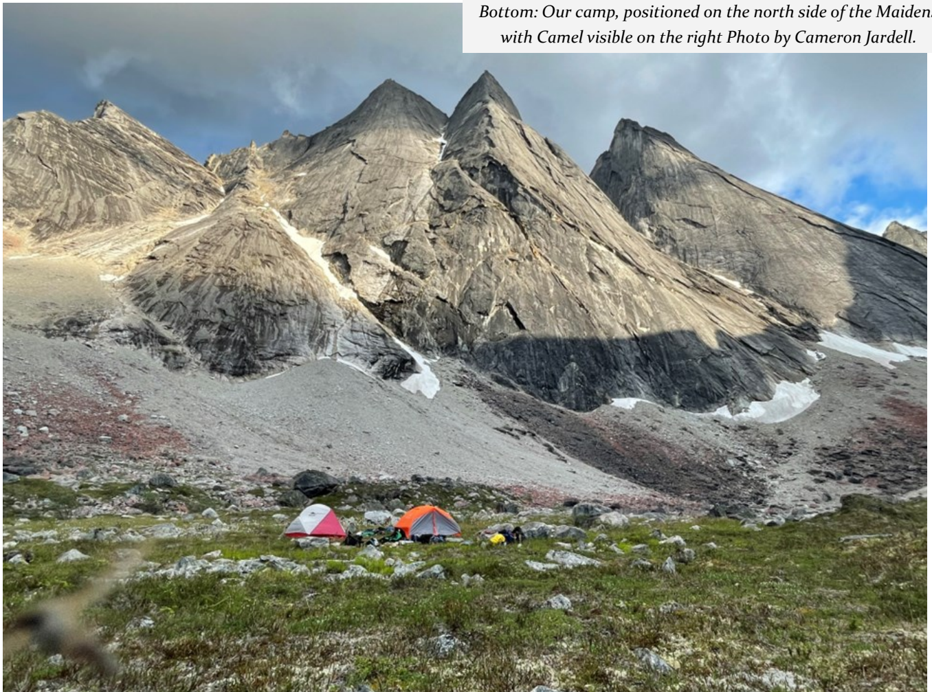
Bottom: Our camp, positioned on the north side of the Maidens with Camel visible on the right