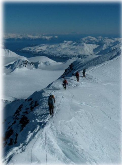
Ascending the east ridge, Prince William Sound in background.

After getting everyone corralled on top, we have to work to keep our jaws from gaping with the view from Skookum Valley to the waters of Prince William Sound. What's up with this prince stuff in the U.S., anyway?