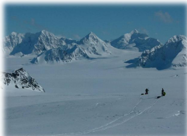
Descending Audubon Pass to the Tazlina Glacier. The four skyline peaks are, from left, Mount Cashman, Island Peak, Mount Shouplina, and Diplodocus.

We continue up the Nelchina Glacier under majestic skies, making reasonable progress for average human-powered travel. In the afternoon we divert to investigate a trail-like line on the glacier. We encounter the returning riders a couple hours later. We know one of them and have a nice chat. He informs us the forecast is still quite good and that there is six feet plus of powder south of Science Pass.