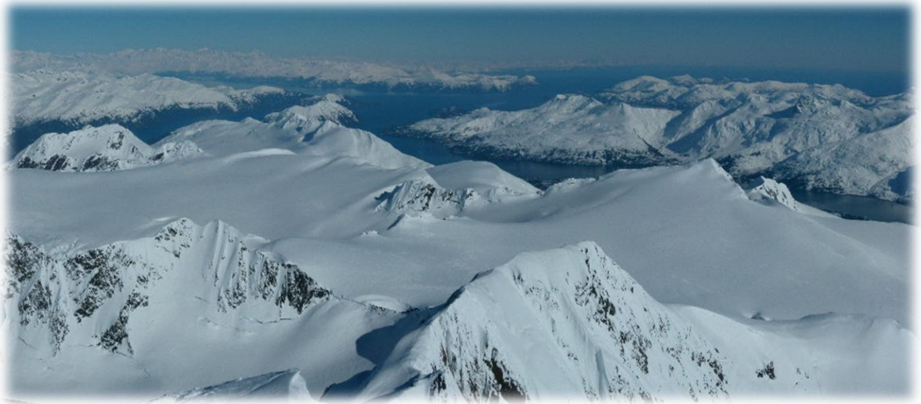
Looking east to Prince William Sound.