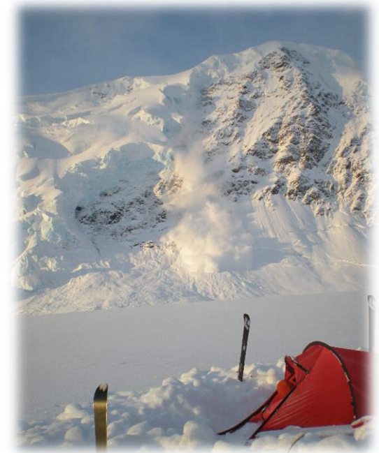
Icefall beyond camp on the Valdez Glacier.

It's snowing in the morning as we break camp. Are we really going to wear hard shells today? No! By the time we head out, it's sunny again. We take the north route, which goes just west of Mount Cashman. A good portion of the day is spent getting everyone and all the gear up Cashman Pass. We limit two people at a time