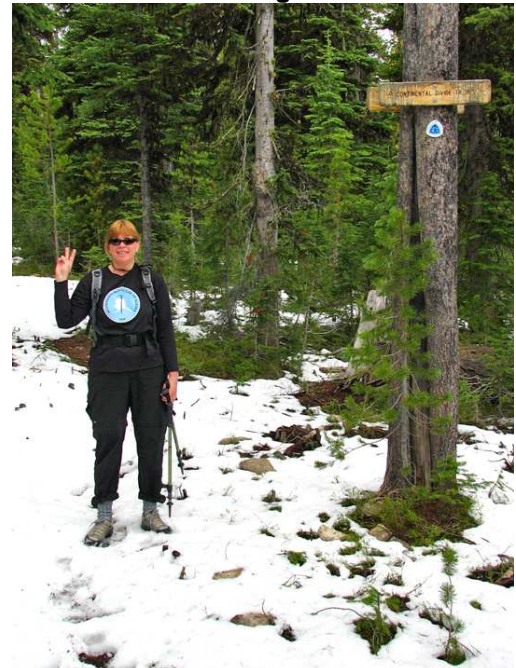
Guess who is in charge of MCA Tshirts

We rode up to Chief Joseph Pass and Trailhead outside of Missoula, which is also the site of a wonderful cross country ski trail system. This pass and trailhead is named after Chief Joseph, the famous leader of the peace-seeking Nez Perce Indians that traveled through this area as they tried to escape from U.S. Military troops and flee to freedom in Canada. Chief Joseph Pass is a few miles away from another mountain pass that