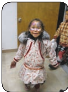
Children visit the Kotzebue District Attorney's Office for Halloween trick-or-treating.

Department attorneys carry an average of over 125 cases, significantly higher than the 100 cases per full-time attorney suggested by the U. S. Department of Health and Human Services. This year the Department represented the Office of Children's Services in 19 appeals involving the termination of parental rights; the state prevailed in all 19.