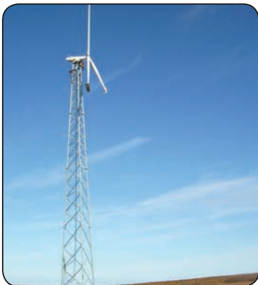
Kotzebue Electric Association wind turbine.

The Department is representing the Department of Revenue in an appeal to the Superior Court of decisions by the state assessment review board, assessing the property tax value of the TAPS at about $4.3 billion for