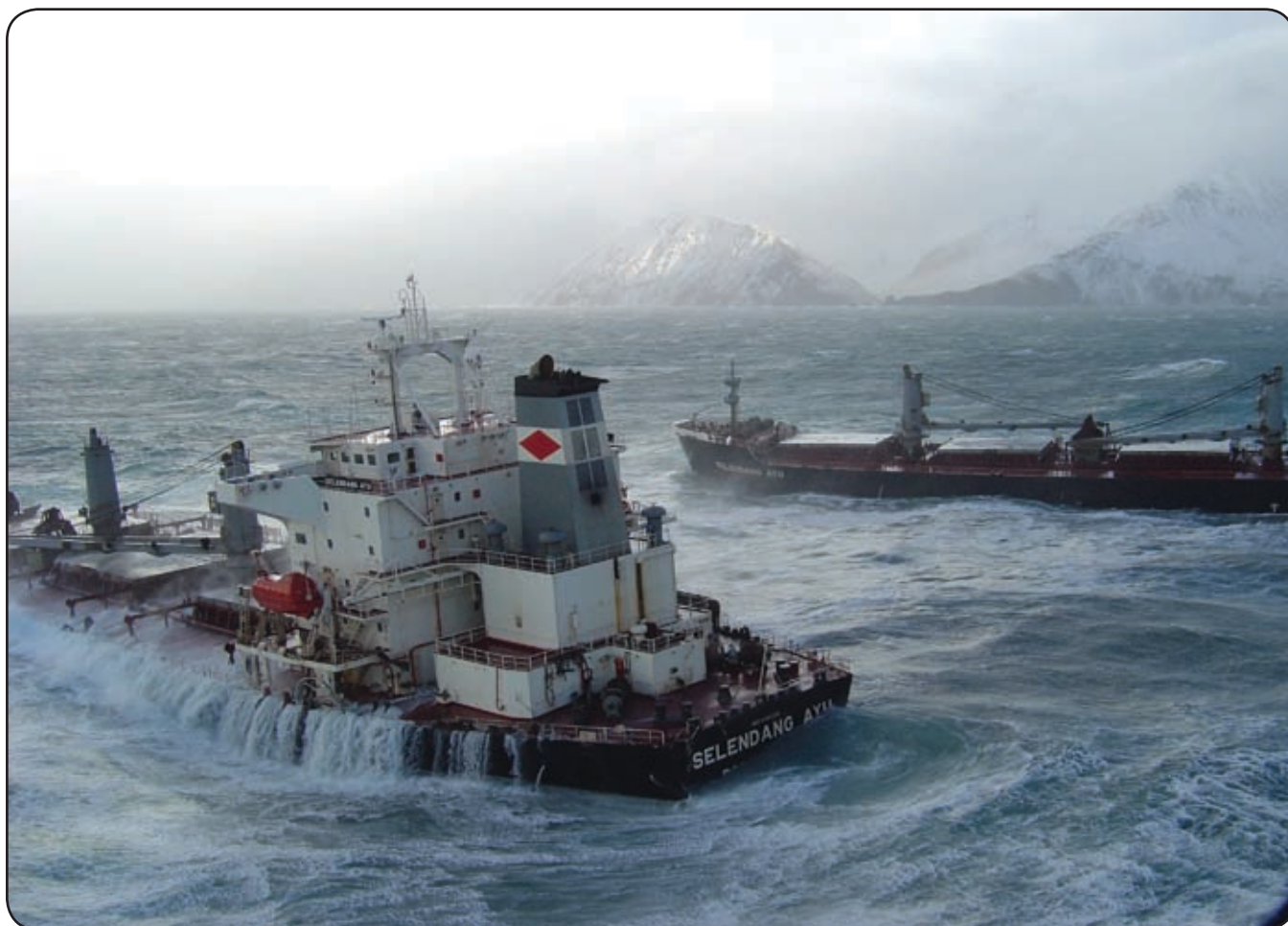
On December 8, 2004, the 738-foot cargo vessel M/V Selendang Ayu, ran aground and broke in half off Unalaska Island in the Aleutian Islands. The vessel's owner has paid more than $800,000 to settle claims from the incident. See page 15.

The Department assisted DEC in the negotiation of two compliance orders by consent between BP Exploration (Alaska) (BPXA) and the Department of Environmental Conservation (DEC). These compliance orders resolve