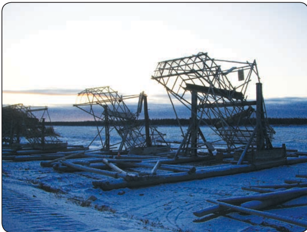
Fish wheels stored on the banks of the Yukon river at Tanana.

In October 2008, the Cook Inlet beluga whale was listed as an endangered species. In January 2009, the department prepared a 60-day notice of intent to sue, filed with National Marine Fisheries Service (NMFS), to challenge various aspects of the listing decision. The department is evaluating its legal options related to the beluga listing. Also, in December 2009, NMFS proposed a critical habitat designation for the beluga whale in Cook Inlet. The department prepared comments on the proposed critical habitat for submission to NMFS, which focused on the action being premature because the proposal did not take into account relevant available information and given the existing state and federal protections already in place, no additional or special management considerations are needed to protect