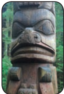
Sitka totem pole.

In 2009, the Department completed phase I of ProLaw, legal management software, completing deployment of the time-keeping and billing system for the Civil Division. Phase II of the project has begun and will incorporate ProLaw's case-management tools. The Department has also entered into a contract to upgrade a new version of the case management system used by the Criminal Division and expects deployment in 2010.