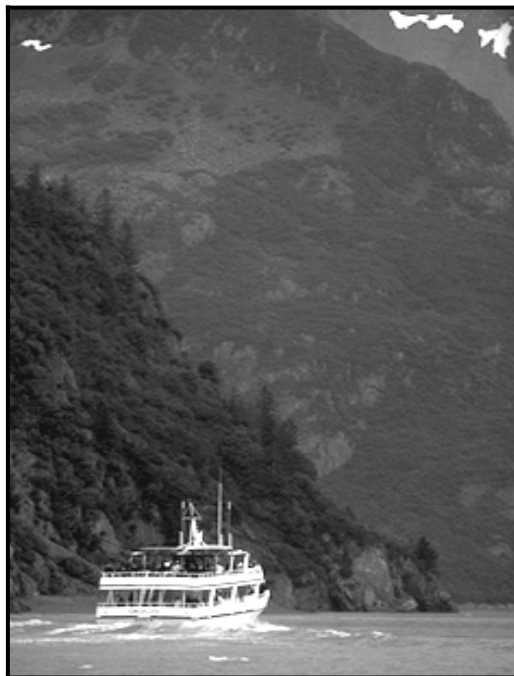
Wildlife tours in Kenai Fjords National Park

Sportfishing resources for which the recovery status is unknown are cutthroat trout, Dolly Varden, and rockfish. In 1992-93, in response to evidence of injury to cutthroat trout, emergency closures were put in place in some locations in Prince William Sound. In addition, bag limits have been reduced since 1991 and a closure during the April 15-June 15 spawning season has been in effect since 1994. These measures reflect the management goals for a potentially