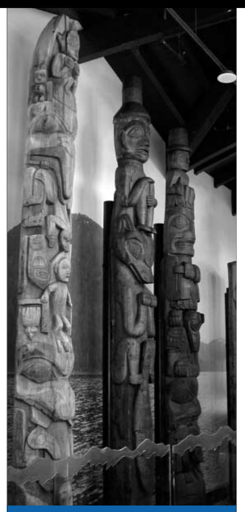
One of the most impressive and moving additions to the remodeled visitor center at Sitka National Historic Park is the Totem Hall. Established in 1910, Sitka is Alaska's oldest national park and commemorates the Battle of Sitka.

The park visitor center is paired with the Southeast Alaska Indian Cultural Center, which was was established in 1969 to impart the cultural values of Southeast Indian Alaska Native culture to students and visitors. The center provides a place for local Tlingits to teach themselves about their own culture, while also helping park visitors understand the Native people whose history is part of the park story. Although it is housed in the park visitor center, the cultural center is an independent, non-profit Native organization.