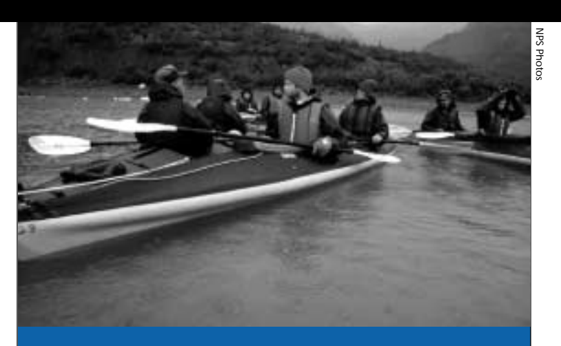
Improving our understanding of marine ecosystems is one of our National Park Service priorities.

Education projects this year include a sponsorship role in the National Ocean Sciences Bowl and the Student Ocean Conference, and programs which bring Alaska high school students to participate in studying the marine ecosystem. Outreach beyond Alaska's boundaries has occurred with Project MASTER (found at