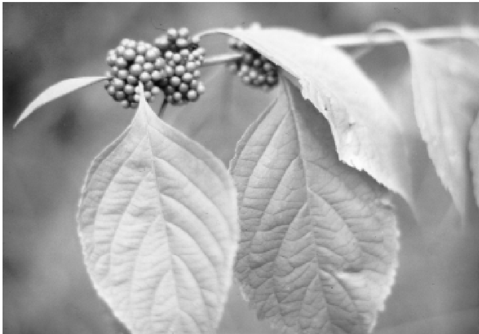
Figure 1. American beautyberry ( Callicarpa americana ), showing clusters of drupes (top) and close-up of drupes and foliage (bottom)