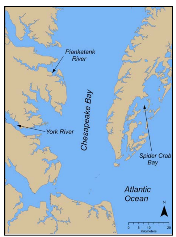
Figure 1. Map of the study areas.

Design and Procedure: Three methods of seeding were tested in this experiment. The first method was a mechanical seed planter (Traber et al. 2003), which consisted of a benthic sled that creates furrows into which a seed-gel mixture is extruded and buried by a weighted pad (Figure 2), and a pump that supplies a mixture of eelgrass seeds and suspension gel through flexible tubing to a manifold (distribution) system located on the sled (Figure 3). The gel (Knox® gelatin in this case) provides a viscous medium for pumping and keeps seeds in suspension in the supply chamber, allowing a predictable rate of seed delivery controlled directly by the pump speed (Figure 4) (Traber et al. 2003). The gelatin was prepared just prior to the experiment and kept chilled on ice until mixing with each batch of seeds. This cooling is essential, as the viscosity of the gelatin varies with temperature. The sled buries seeds to a depth of 1-2 cm below the sediment surface through eight injectors distributed along its 1-m width (Figure 5).