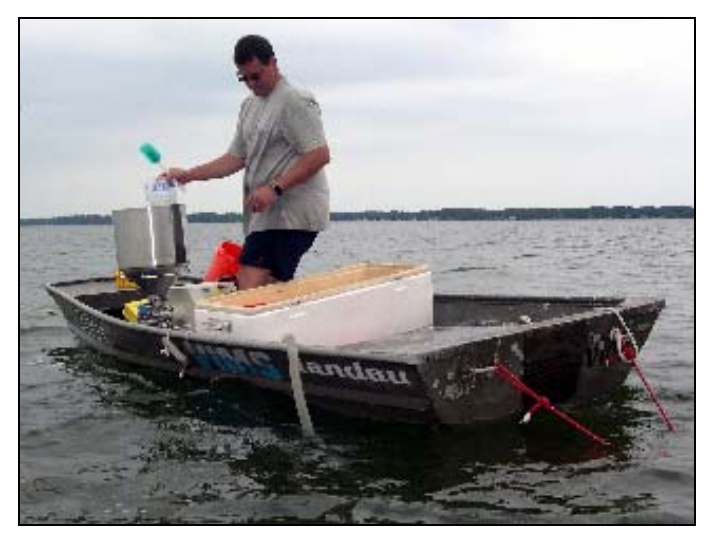
Figure 6. Pumping seeds to the deployed planting sled.

Seeds were harvested by hand collecting mature reproductive shoots with viable seeds from established beds in late May 2005. Seeds are generally released from the flowering shoots from mid-May into early June in Chesapeake Bay. Harvested shoots were placed in nylon mesh bags, returned to the laboratory, and placed in flow-through, circular, 3.8-m<sup>3</sup> outdoor tanks that were shaded (approximately 50 percent) and aerated. Shoots were maintained in the tanks for up to 8 weeks until mid- to late July to allow for decomposition of the shoots and release of