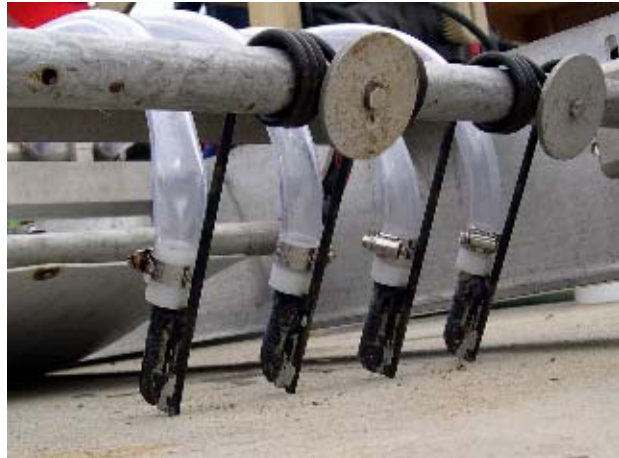
Figure 5. Spring-loaded seed injecting nozzles.