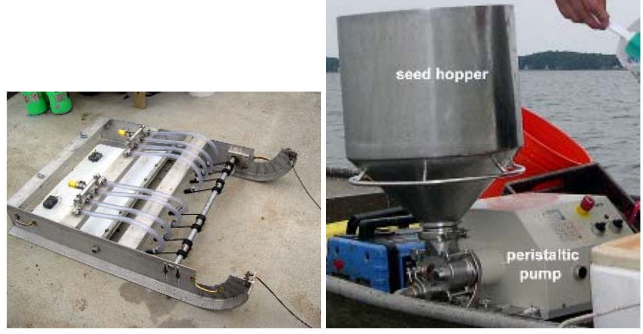
Figure 2. Zostera marina seed planting sled.