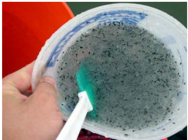
Figure 4. Seeds suspended in gel.